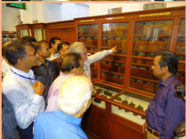
Hon'ble Governor of West Bengal Sri Keshari Nath Tripathi and Hon'ble Union Minister for Environment, Forest & Climate Change Dr. Harsh Vardhan inaugurating Botanical Gallery at ISIM, Kolkata on 09.05.2018