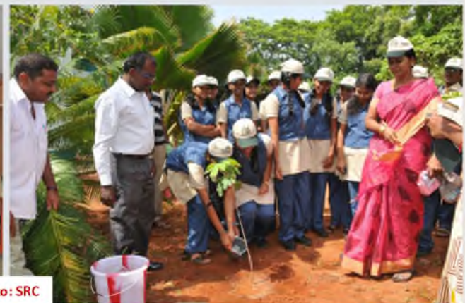
Plantation during International Day for Biological Diversity programme at SRC, BSI, Coimbatore