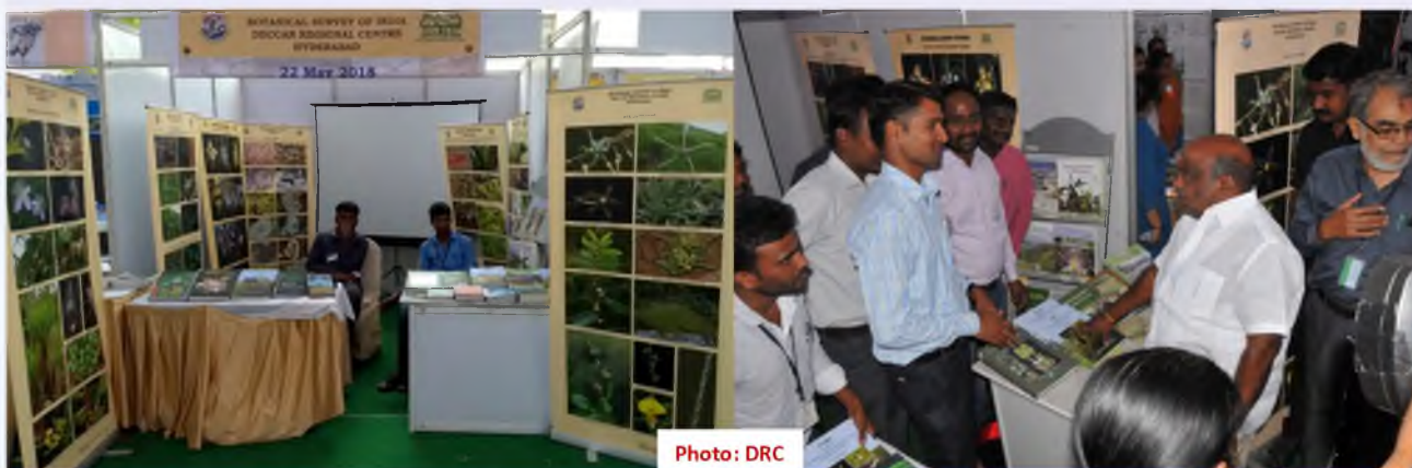
BSI exhibition stall at International Day for Biological Diversity celebration at Hyderabad on 22.05.2018