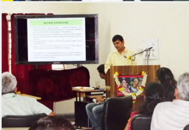
Celebration of International Biodiversity Day 2018 at WRC, Pune