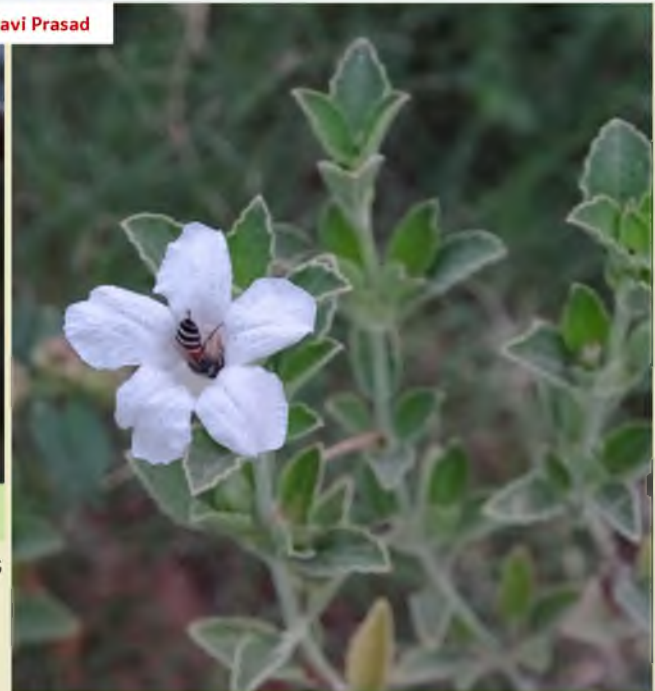
Ruellia patula in flowering at AZRC,BSI, Jodhpur