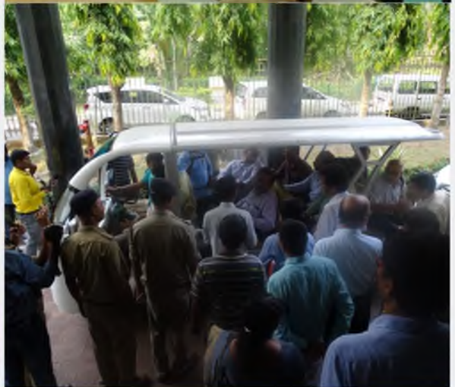
Visit of Hon'ble Union Minister for Environment, Forest and Climate Change, Dr. Harsh Vardhan to Acharya Jagadish Chandra Bose Indian Botanical Garden and Central National Herbarium, Botanical Survey of India, Howrah on 09.05.2018 (pages 15 & 16)

Thanks to all the scientists and staff of regional centres and units of BSI for contributing to this Newsletter