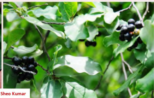
Polyalthia suberosa in fruiting at associated garden of CRC, BSI, Allahabad

Phenological stages (criteria-wise) of 149 plant species were recorded during May, 2018 among 124, 75 and 57 species formed flowers, fruits and seeds respectively of the associated Botanical garden of CRC, BSI, Allahabad.